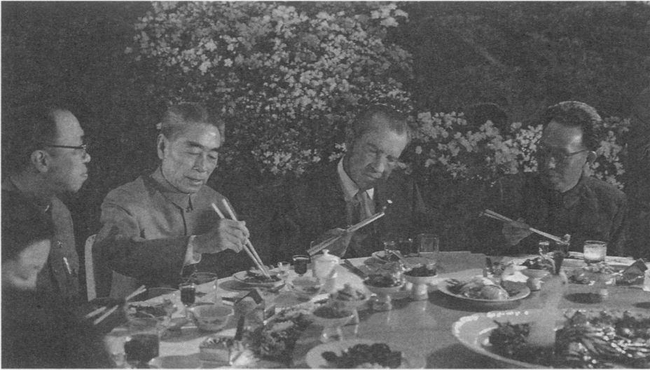
During his February 1972 trip to China, Richard M. Nixon (third from left) shares a banquet meal with Chinese premier Zhou Enlai (second from left) after discussions about Taiwan, Japan, the Soviet Union, and other issues.

ing. Even as a group led by the conservative intellectual William F. Buckley Jr. broke with the president, questioning Nixon's conservative credentials, many were loath to be seen as attacking Nixon and swallowed their discontent. Ronald Reagan, for instance, having supported the China opening only to see Taiwan expelled from the UN, chafed at the stain on his credibility. Kissinger sought to reassure him, promising there would be consequences "for every country that voted against us that didn't have an overpowering reason." Kissinger counseled patience, explaining "we feel we have to do it in our own devious way," and Reagan went along because he put the anti-Soviet thrust of administration policy ahead of Taiwan's interests. Walter Judd secretly pledged support for the president, confidentially telling Kissinger that reports of his opposition would actually "strengthen [the national security adviser's] hand" in negotiations with the Chinese. 72