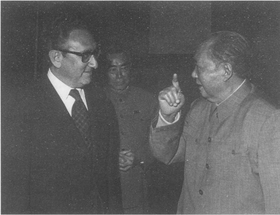
As Premier Zhou Enlai watches, Chairman Mao Zedong lectures National Security Adviser Henry Kissinger during his 1971 trip to China. Courtesy National Archives, 22 Feb 73 E 320.

The place of Taiwan in the calculus of the American China initiative illustrates the problem of relating to and dispensing with U.S. client states, given the dynamic ways democracy may intervene in foreign policy making. 5 If Taiwan appeared expendable to those in the White House who were defining policy, others in the government, the Congress, and the public did not agree. The disagreement set up a struggle on the right and left of U.S. politics, and it ought to have mobilized the reputedly indomitable China lobby, with its potent American and Taiwan branches, to keep the Nixon administration from damaging Taiwan's interests. But derailing the rush to Beijing proved a mighty challenge even for a force conventionally rated second only to the pro-Israel lobby for its effectiveness in Washington. 6